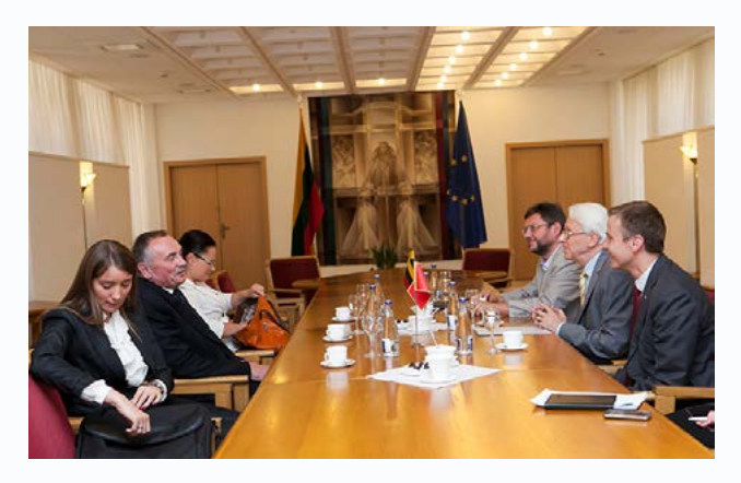
Members of the Seimas Committee on Foreign Affairs and of the Committee on European Affairs met with Branko Radulović, Vice President of the Parliament of Montenegro. 10 June 2015.