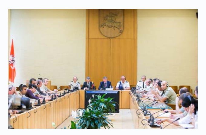
Meeting between the representatives of the NATO Defense College and Artūras Paulauskas, Chair of the Seimas Committee on National Security and Defence. 17 June 2015.