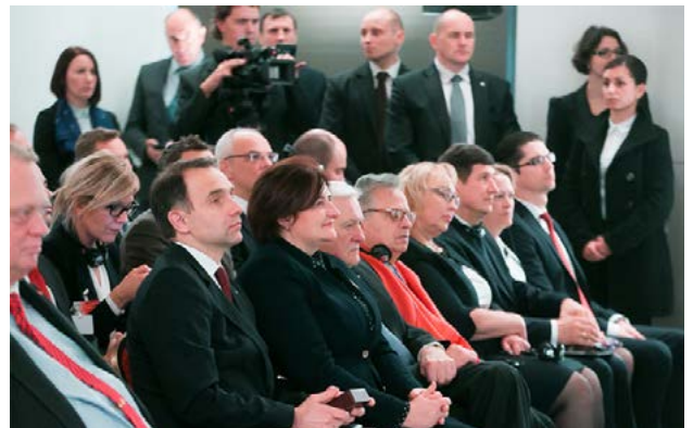
Loreta Graužinienė, Speaker of the Seimas, participated in the solemn launching of NordBalt and LitPol Link interconnections. 14 December 2015