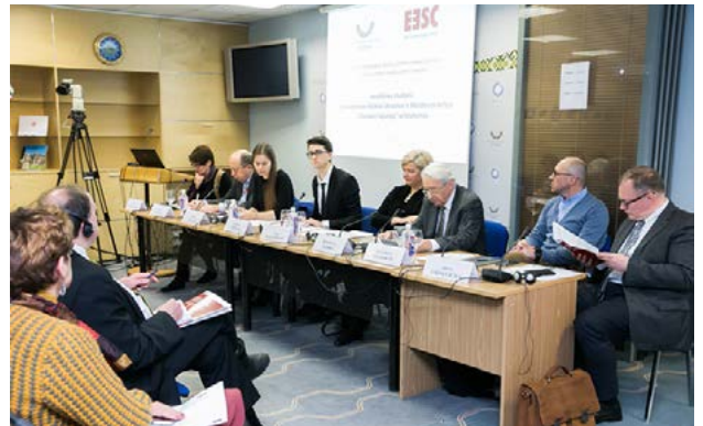
Presentation of the analytical study Economic Challenges of Ukraine and Moldova on the Way to EU. 11 December 2015