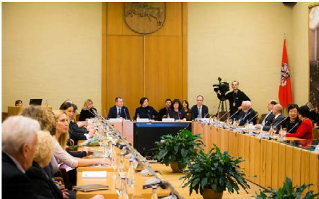
Solemn meeting dedicated to the International Human Rights Day and the 25th anniversary of the Seimas Committee on Human Rights. 9 December 2015