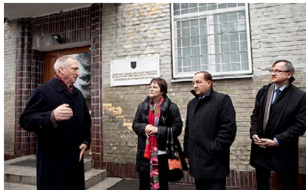
A delegation of Members of the Seimas visited the Foreigners' Registration Centre in Pabradė, Lithuania. 18 December 2015