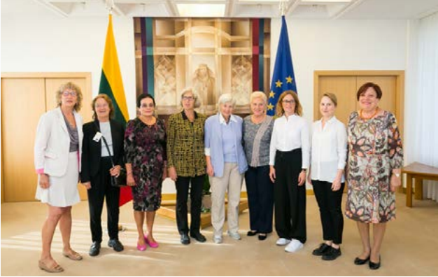
Irena Degutienė, Deputy Speaker of the Seimas, Marija Aušrinė Pavilionienė and Giedrė Purvaneckienė meet with the delegation of the Svenska Kvinnors EuropaNätverk, Swedish women's European network. 4 September 2015