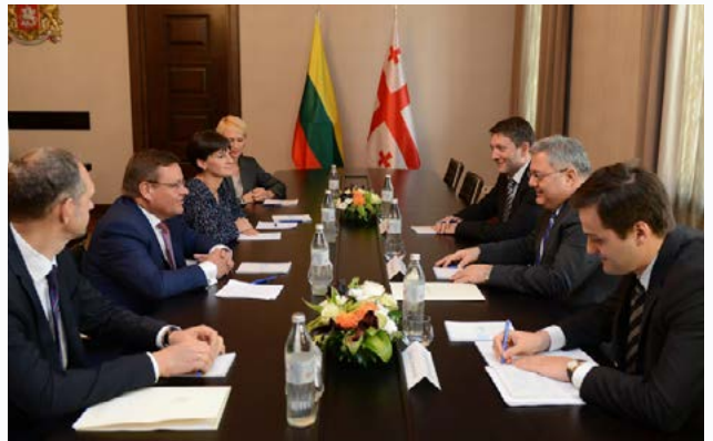
Vydas Gedvilas, First Deputy Speaker of the Seimas, meets David Usupashvili, Speaker of the Parliament of Georgia. 15 September 2015