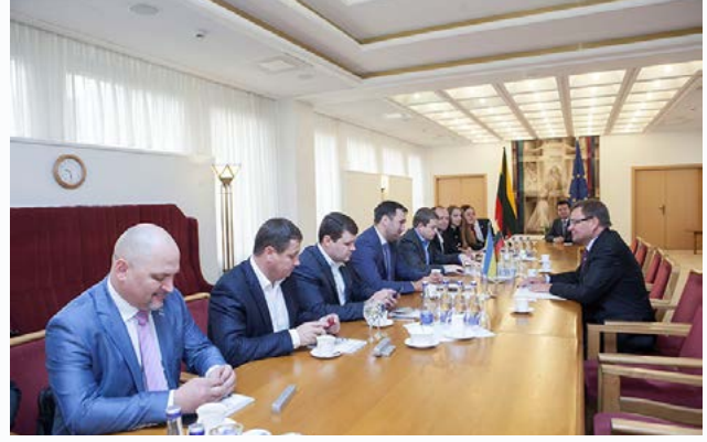
Vydas Gedvilas, First Deputy Speaker of the Seimas, meets the delegation of the members of the Verkhovna Rada of Ukraine. 23 September 2015

For more photos of the September 2015 events and meetings, see here .