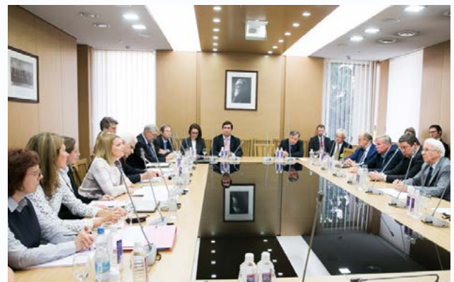
Members of the Seimas Committees on Foreign Affairs, on European Affairs, and on Economics meet with the expert delegation of the Organisation for Economic Cooperation and Development, headed by Mari Kiviniemi, Deputy Secretary-General of the OECD. 17 September 2015