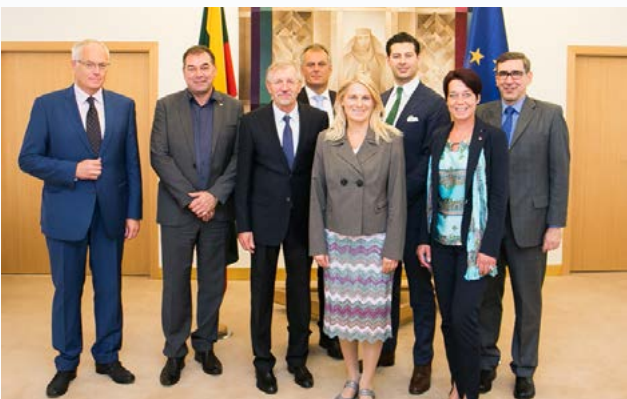
Gediminas Kirkilas, Chair of the Seimas Committee on European Affairs, meets with the Group for Inter-parliamentary Relations with the Baltic States of the Austrian Parliament. 17 September 2015