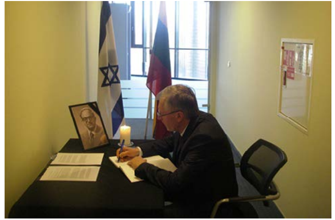
The Deputy Speaker of the Seimas, Chair of the Committee on European Affairs, Gediminas Kirkilas, signs in the book of condolences at the Embassy of Israel in Vilnius on the death of the former President of the State of Israel, Yitzhak Navon. 10 November 2015.