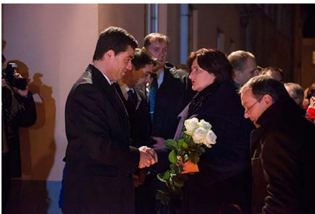
The Speaker of the Seimas, Loreta Graužinienė, pays tribute to the memory of the victims of terrorism at the Embassy of the French Republic. 15 November 2015

For more photos of the November 2015 events and meetings, see here .