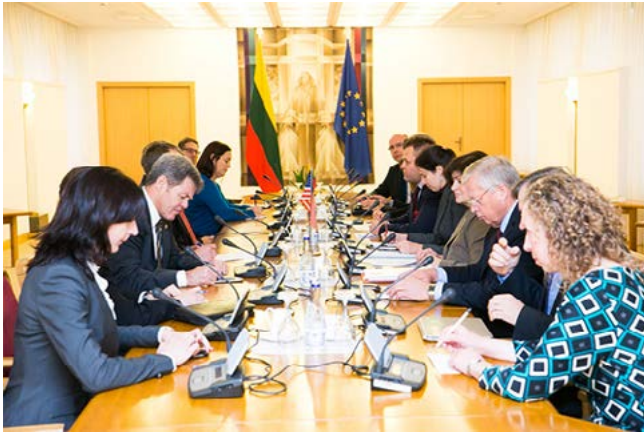
Members of the Group for Inter-Parliamentary Relations with the United States of America meet with the Congressional Staff Delegation from the USA. 10 November 2015