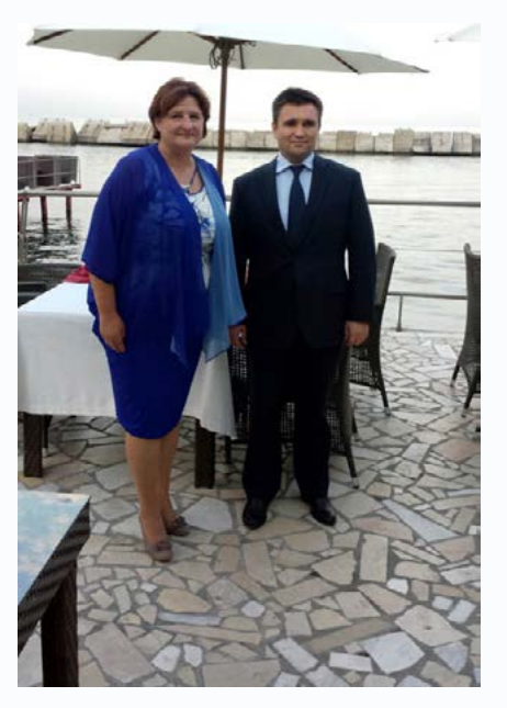
During her visit to Ukraine, Loreta Graužinienė, Speaker of the Seimas, met with Pavlo Klimkin, Minister of Foreign Affairs of Ukraine. 13 August 2015