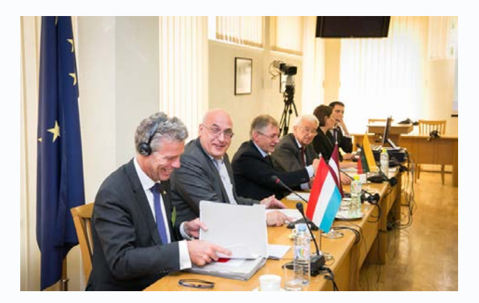
Georges Faber, Ambassador Extraordinary and Plenipotentiary of the Grand Duchy of Luxembourg to Lithuania, presented the priorities of the Luxembourg Presidency of the Council of the EU from July to December 2015 to a joint meeting of the Committees on European Affairs and Foreign Affairs of the Seimas. Mārtiņš Virsis, Ambassador of Latvia to Lithuania, recalled the achievements of the outgoing Latvian Presidency from January to June 2015. 15 July 2015