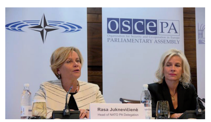
Press conference by Rasa Juknevičienė, President of the NATO PA delegation that monitored the elections in Bosnia and Herzegovina. Photo of the NATO PA Bureau. 9 October 2018