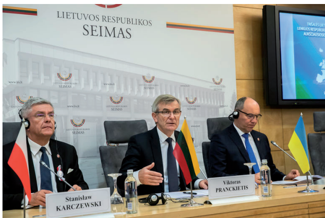
Press conference delivered by Viktoras Pranckietis, Speaker of the Seimas of the Republic of Lithuania; Stanisław Karzewski, Marshal of the Senate of the Republic of Poland; and Andriy Parubiy, Speaker of the Verkhovna Rada of Ukraine. 13 November 2018