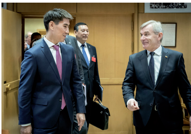
Viktoras Pranckietis, Speaker of the Seimas, met with Chingiz Aidarbekov, Minister of Foreign Affairs of the Republic of Kyrgyzstan. 21 November 2018.