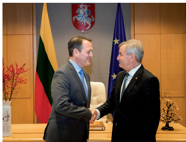
Viktoras Pranckietis, Speaker of the Seimas, met with Kevin Rex, Ambassador of Canada to Lithuania. 22 November 2018