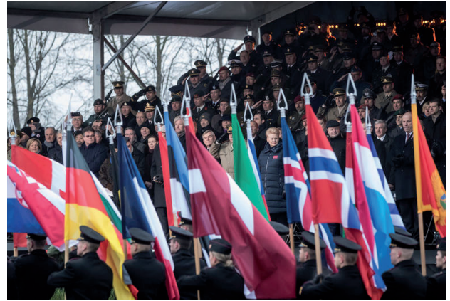
Viktoras Pranckietis, Speaker of the Seimas, observed a solemn line and parade of the Lithuanian Armed Forces. Photo album (28 photos). 24 November 2018