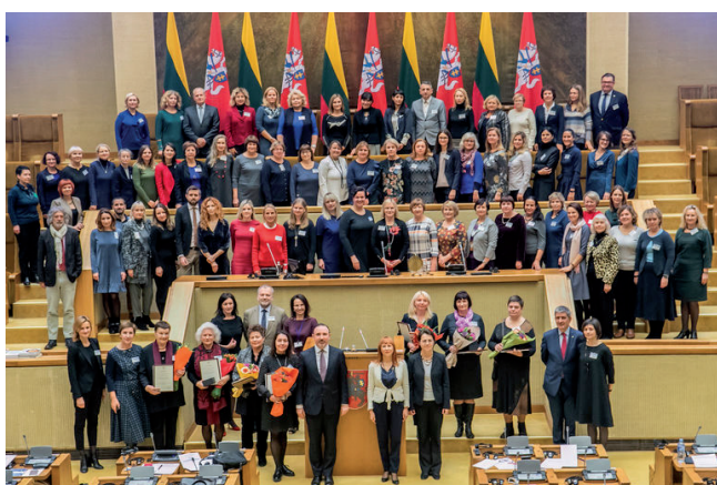
Participants of the Forum Sustainable Francophonie: Teacher's Role . 9 November 2018