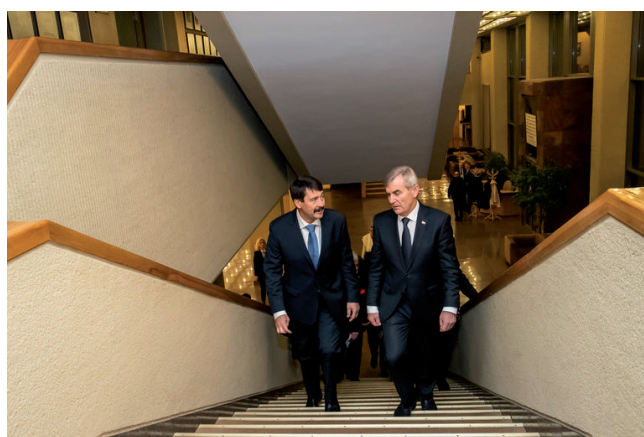
Meeting between Viktoras Pranckietis, Speaker of the Seimas, and János Áder, President of Hungary. 13 November 2018