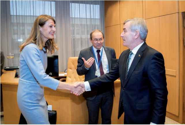
Meeting between Viktoras Pranckietis, Speaker of the Seimas, and Yvonne Tonic-Sorinj, Ambassador of the Republic of Austria to Lithuania. 22 November 2018