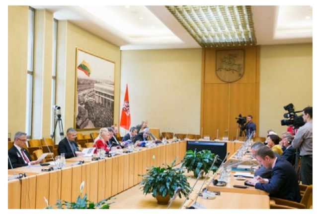
Discussion between Members of the NATO PA delegation and Members of the Seimas on security issues, 9 May 2016