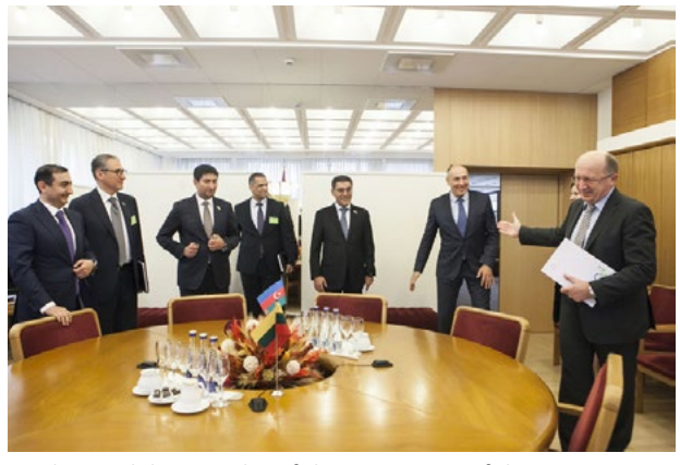
Andrius Kubilius, Leader of the Opposition of the Seimas, met with the delegation of the National Assembly of the Republic of Azerbaijan, 17 May 2016