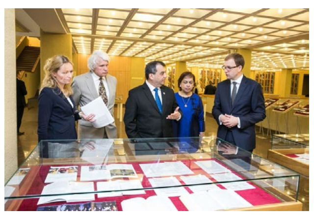
Saber Chowdhury, President of the Inter-Parliamentary Union, viewed the exhibition dedicated to Lithuania's membership of the Inter-Parliamentary Union. 7 June 2016