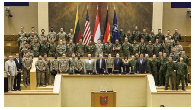
Meeting with NATO troops deployed in Lithuania. 3 June 2016