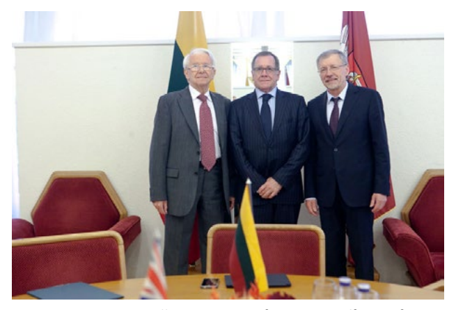
Murray Stuart McCully, Minister of Foreign Affairs of New Zealand, met with Gediminas Kirkilas, Deputy Speaker of the Seimas and Chair of the Committee on European Affairs, and Benediktas Juodka, Chair of the Committee on Foreign Affairs, at the Seimas. 17 June 2016