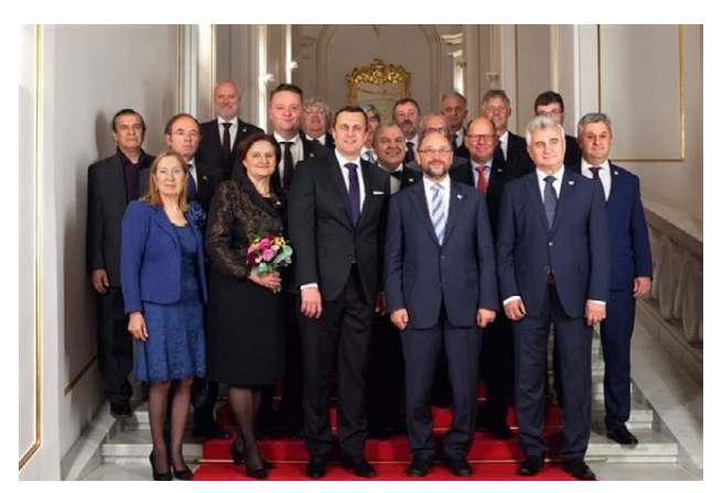
Loreta Graužinienė, Speaker of the Seimas, attended an Informal Meeting of Speakers of the EU Parliaments in Bratislava, Slovak Republic. 7 October 2016