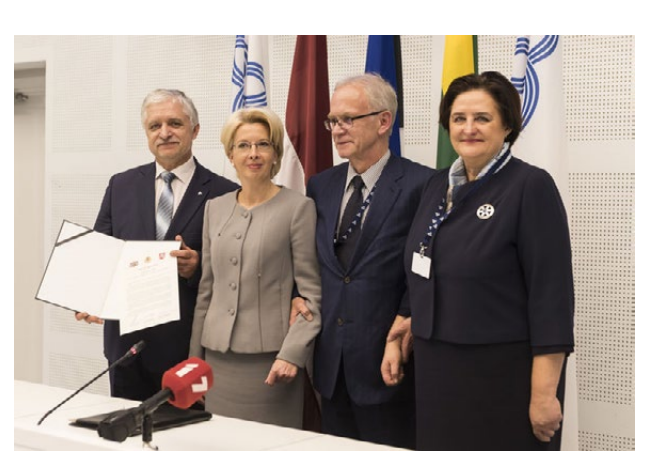
On the occasion of the 25th anniversary of the Baltic Assembly, the Speakers of the Lithuanian Seimas, Latvian Saeima, and Estonian Riigikogu signed a letter of appreciation honouring the founders, supporters and promoters of the parliamentary cooperation of the three Baltic States. 27 October 2016