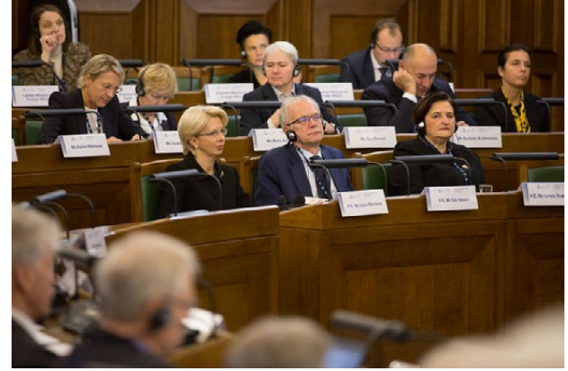
Loreta Graužinienė, Speaker of the Seimas, attended the 35th Session of the Baltic Assembly in Riga, Latvia. 27 October 2016