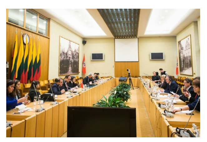
Meeting of the members of the Seimas Committees on Legal Affairs and on Human Rights with the delegation of representatives of the Ministries of Justice and of Finance of Turkey and the Turkish Bar Association. 26 October 2016