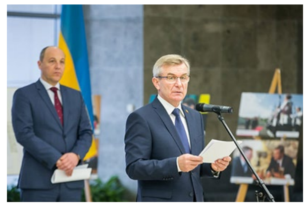
Speaker of the Lithuanian Seimas and Chairman of the Ukrainian Verkhovna Rada opened the exhibition titled Lithuania and Ukraine: 25 Years of Partnership. 28 November 2016