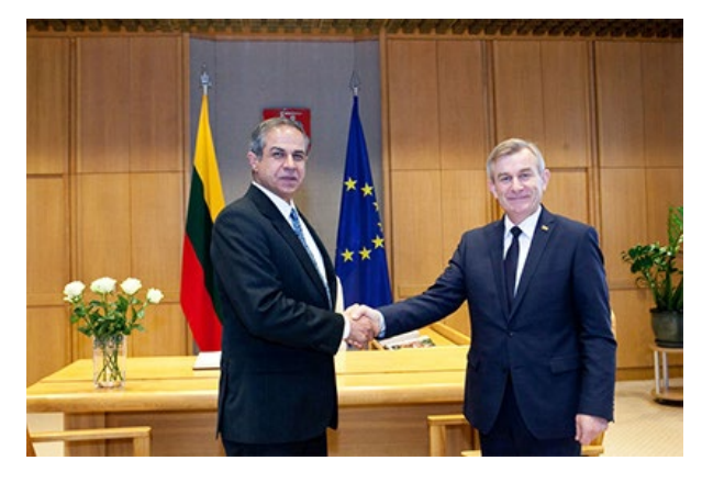
Viktoras Pranckietis, Speaker of the Seimas, met with Amir Maimon, Ambassador of the State of Israel. 29 November 2016