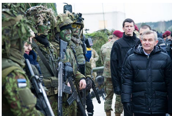
Viktoras Pranckietis, Speaker of the Seimas, watched the international exercise Iron Sword 2016 . 2 December 2016