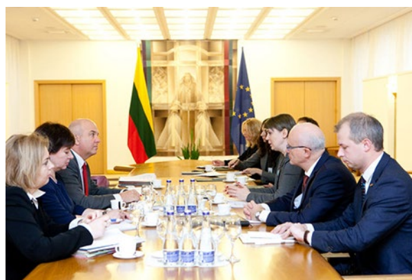
Members of the Seimas Delegation to the Parliamentary Assembly of the Council of Europe met with the Commissioner for Human Rights of the Council of Europe. 7 December 2016