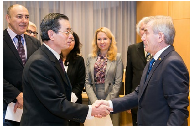
Viktoras Prancietis, Speaker of the Seimas, received Wei Ruixing, Ambassador of the People's Republic of China to Lithuania. 9 December 2016