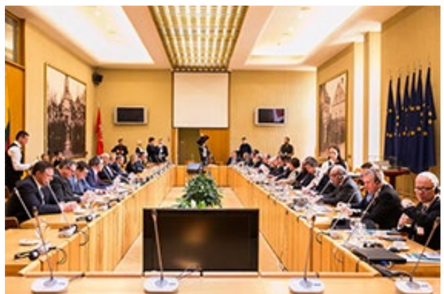
Meeting between the delegation of the NATO Parliamentary Assembly and Members of the Seimas. 13 March 2017