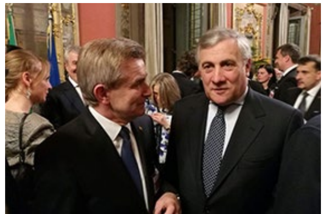
Viktoras Pranckietis, Speaker of the Seimas, and Antonio Tajani, President of the European Parliament. 17 March 2017