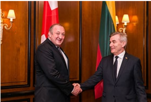
Meeting between Viktoras Pranckietis, Speaker of the Seimas, and Giorgi Margelashvili, President of Georgia. 30 March 2017

For more photos of the March 2017 events and meetings, see here or please visit the Seimas Flickr account.