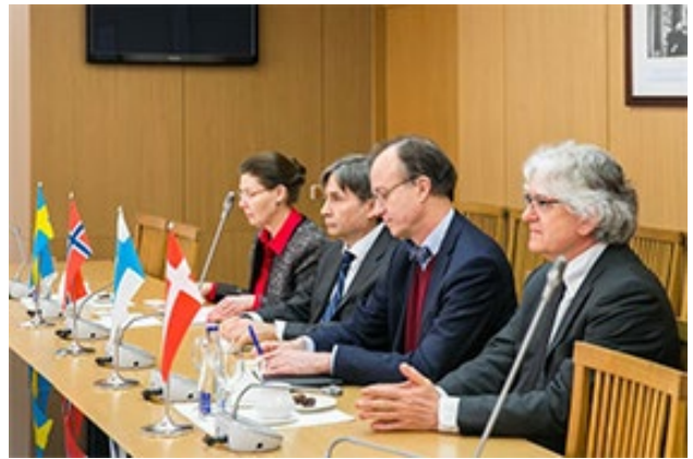
Meeting between members of the Group for Inter-Parliamentary Relations with North European Countries and Ambassadors of the Kingdom of Denmark, the Kingdom of Norway, the Republic of Finland, and the Kingdom of Sweden. 2 March 2017