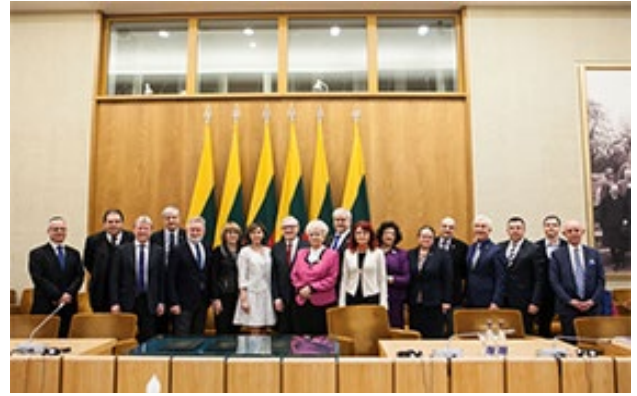
Meeting of the Committee on Social Affairs and Labour and the Committee on Health Affairs with the delegation of the Committee on Health and Social Policy of the Senate of the Parliament of the Czech Republic. 15 March 2017