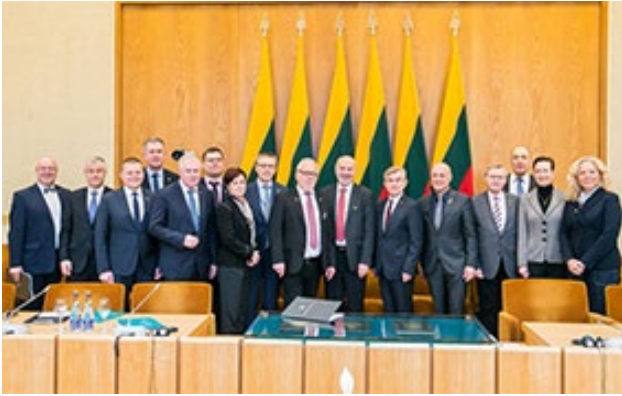
Meeting between Viktoras Pranckietis, Speaker of the Seimas, and the Committee on National Security and Defence, and the delegation of the Defence Committee of the German Bundestag. 14 March 2017.