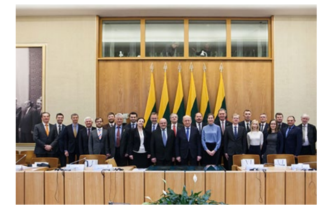
Meeting of the Legal Affairs and Security Committee of the Baltic Assembly. 12 May 2017