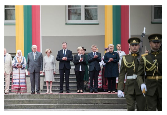
Solemn ceremony of hoisting the national flag and the historic flag of Lithuania on the occasion of the State Day of Lithuania (Coronation of King Mindaugas). 6 July 2017