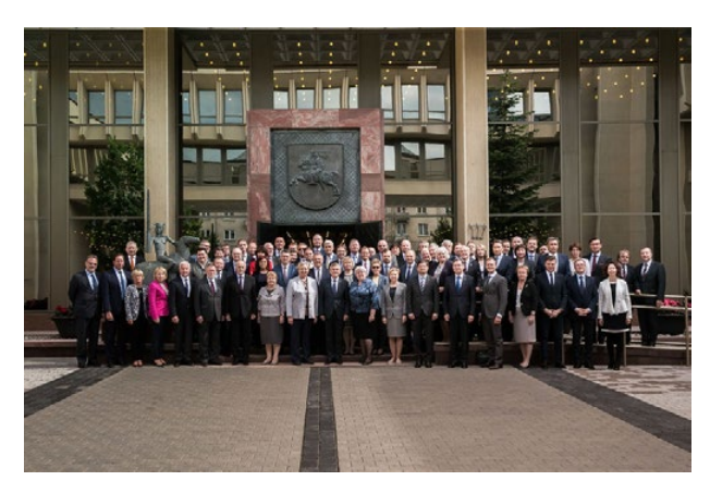
Viktoras Pranckietis, Speaker of the Seimas, and the participants of the annual meeting of ambassadors of the Republic of Lithuania. 4 July 2017