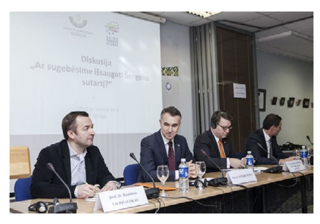
The Seimas Committee on European Affairs and the Seimas European Club hold the debate Could the Schengen Agreement be saved? 19 February 2016