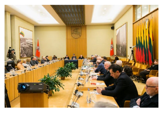
Commemoration of the 25th anniversary of the general plebiscite of the Lithuanian population. 9 February 2016