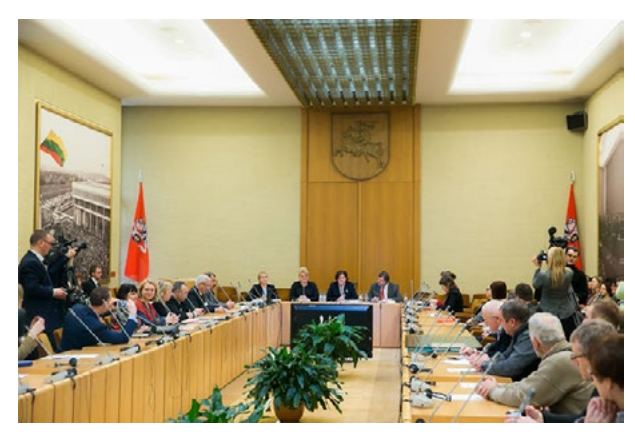
Loreta Graužinienė, Speaker of the Seimas, welcomed the participants of the international conference Social Europe: Present and Future. 10 February 2016