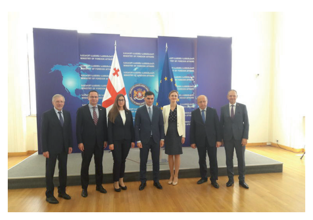
Delegation of Members of the Seimas paid an official visit to Georgia. 12 September 2017