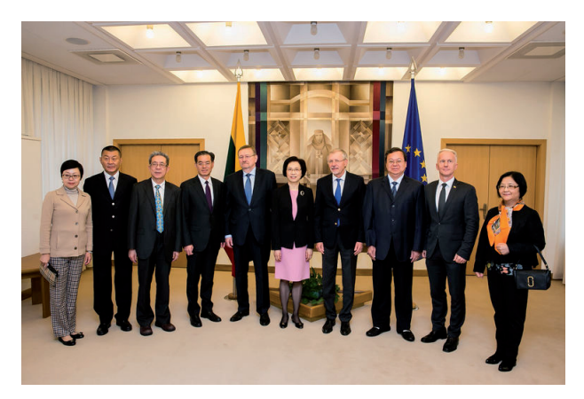
Gediminas Kirkilas, Deputy Speaker of the Seimas, Chair of the Committee on European Affairs, met with the delegation from Shanghai, China. 5 September 2017