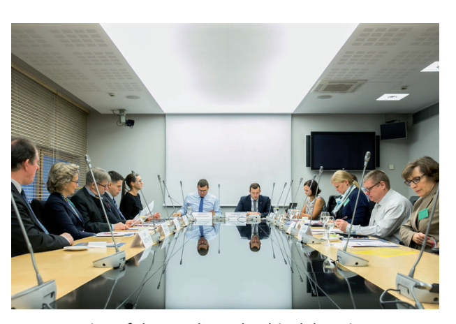
Meeting of the Nordic and Baltic delegations to the OSCE Parliamentary Assembly. 18 September 2017