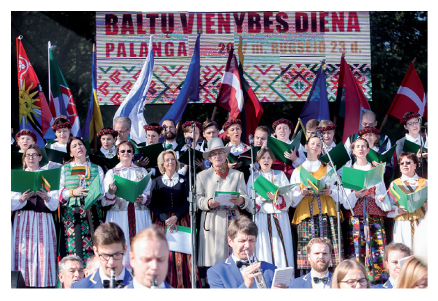
Viktoras Pranckietis, Speaker of the Seimas, and Ināra Mūrniece, Speaker of the Saeima of Latvia, met in Palanga in celebration of the Day of Baltic Unity. 23 September 2017