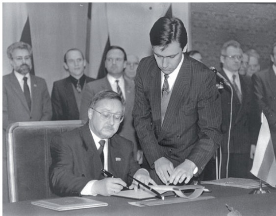
Photo and documentary exhibition to mark the 25th Anniversary of the Constitution