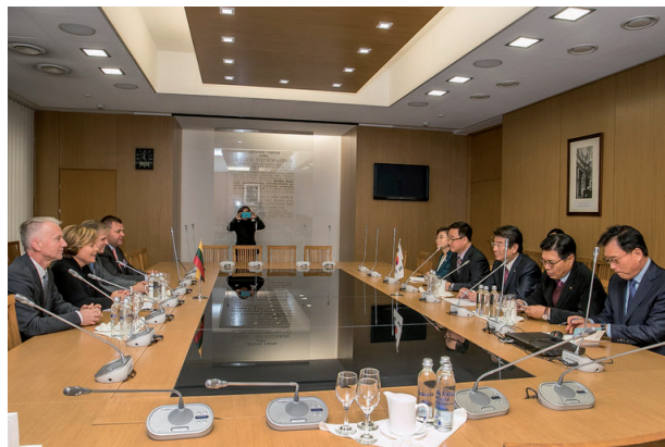
Meeting between the delegation of the National Assembly of the Republic of Korea and Members of the Seimas Group for Inter-Parliamentary Relations with the Republic of Korea. 5 October 2017