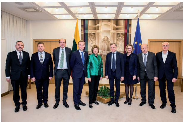
Meeting of the Committee on European Affairs with the Rt Hon. Baroness Anelay of St Johns, Minister of State for the Commonwealth and the UN at the Foreign & Commonwealth Office. 4 October 2017