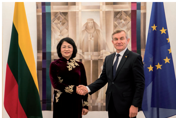
Meeting of Viktoras Prancietis, Speaker of the Seimas, with Dang Thi Ngoc Thinh, Vice President of Vietnam. 23 October 2017