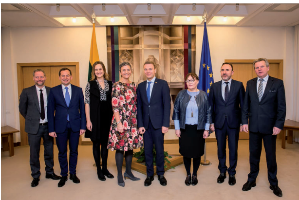
Meeting of the Committee on European Affairs with Margrethe Vestager, European Commissioner for Competition. 10 October 2017