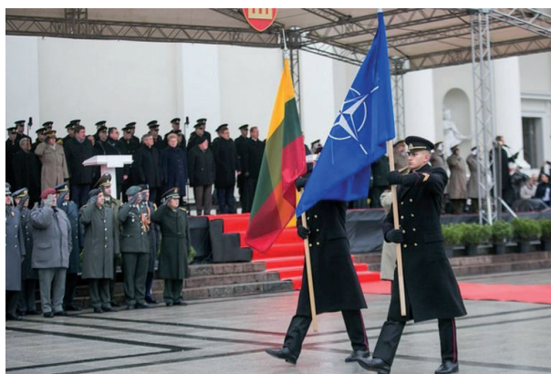
Viktoras Prancietis, Speaker of the Seimas, attended a solemn formation on 23 November, the Lithuanian Armed Forces Day. 23 November 2017