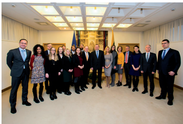
Meeting between the Committee on Foreign Affairs, the Committee on National Security and Defence and the delegation of the US Congress administration. 24 November 2017