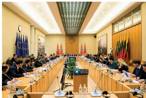
Presentation of the initiative European Plan for Ukraine . 6 November 2017