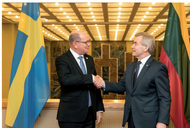
Meeting of Viktoras Prancietis, Speaker of the Seimas, and Urban Ahlin, Speaker of the Riksdag of the Kingdom of Sweden. 20 November 2017