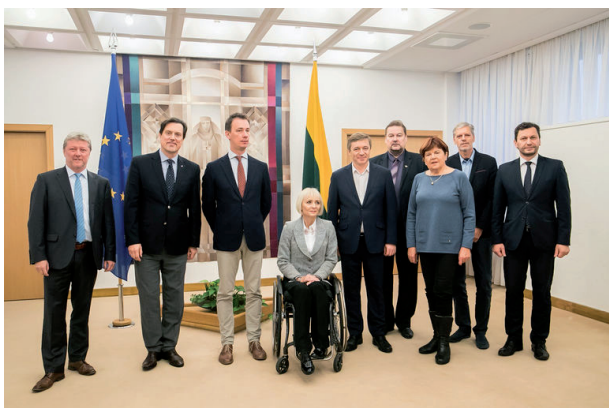
Meeting between the Committee on Culture and representatives of the Standing Commission on Media of the Senate of the Czech Republic. 15 November 2017