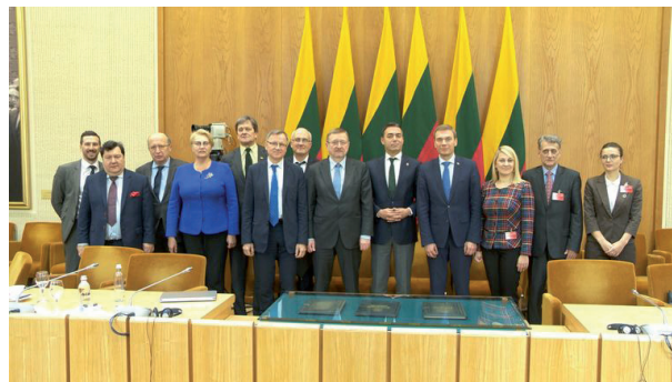
Members of the Committee on European Affairs, the Committee on Foreign Affairs and the Group for Inter-Parliamentary Relations with the Western Balkan Countries, met with Nikola Dimitrov, Foreign Minister of the Former Yugoslav Republic of Macedonia. 3 November 2017