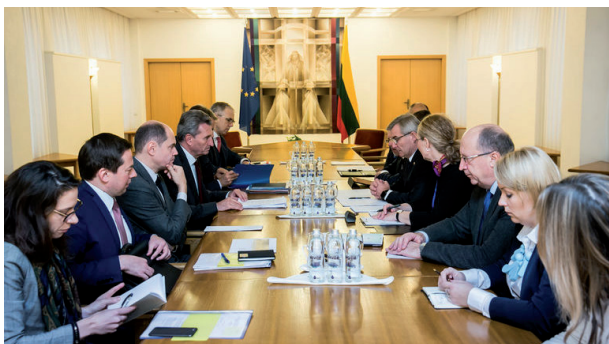
Viktoras Prancietis, Speaker of the Seimas, met with Günther Oettinger, Member of the European Commission. 2 November 2017