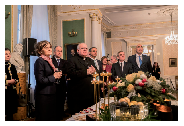
Meeting of Viktoras Pranckietis, Speaker of the Seimas, with foreign ambassadors residing in Lithuania. 8 December 2017.