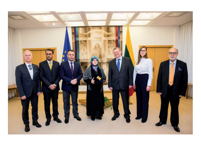
Meeting between Members of the Committee on Foreign Affairs and a delegation of the Iraqi Parliament. 6 December 2017