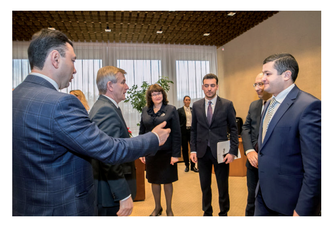
Viktoras Pranckietis, Speaker of the Seimas, receiving a delegation of the Parliament of the Republic of Armenia. 13 December 2017