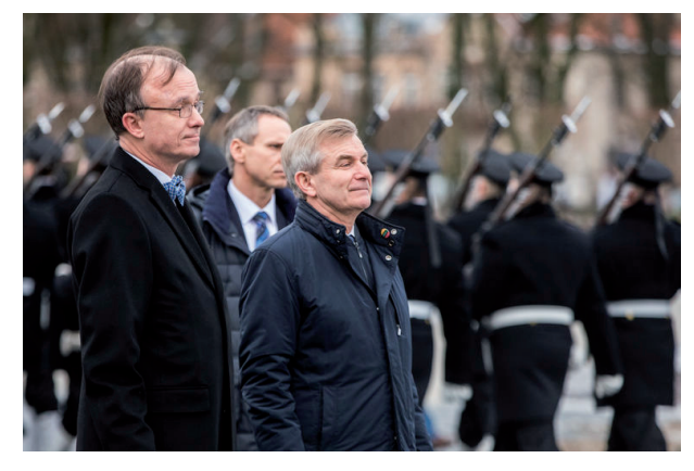
Viktoras Pranckietis, Speaker of the Seimas, participated in the ceremony of hoisting the state flag of the Republic of Lithuania and the national flag of the Republic of Finland to commemorate the 100th anniversary of independence of Finland. 6 December 2017