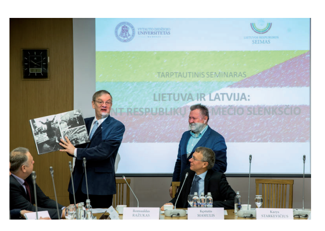
International seminar Lithuania and Latvia: on the threshold of the Centenaries of the two Republics. 8 December 2017