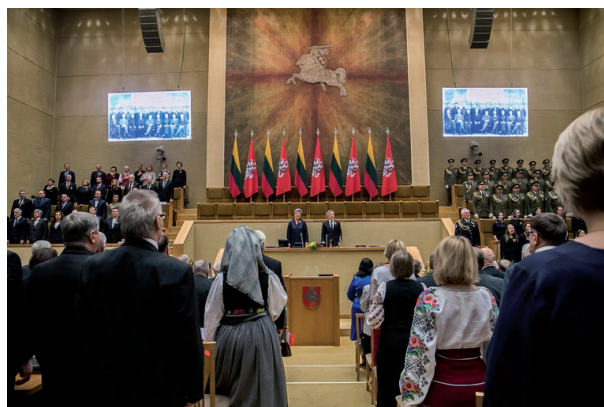
Solemn commemoration dedicated to the Centenary of the Restoration of the State of Lithuania at the Seimas of the Republic of Lithuania. 15 February 2018