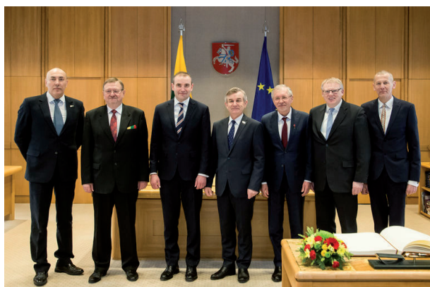
Meeting between Viktoras Pranckietis, Speaker of the Seimas, and Guðni Thorlacius Jóhannesson, President of Iceland. 15 February 2018