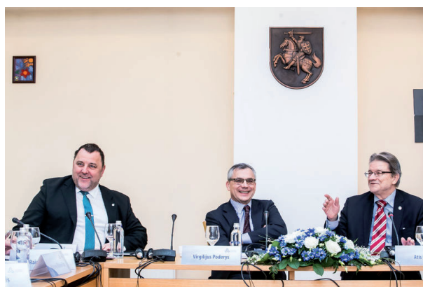
Joint meeting of the Economics, Energy and Innovation Committee and the Natural Resources and Environment Committee of the Baltic Assembly. 9 February 2018