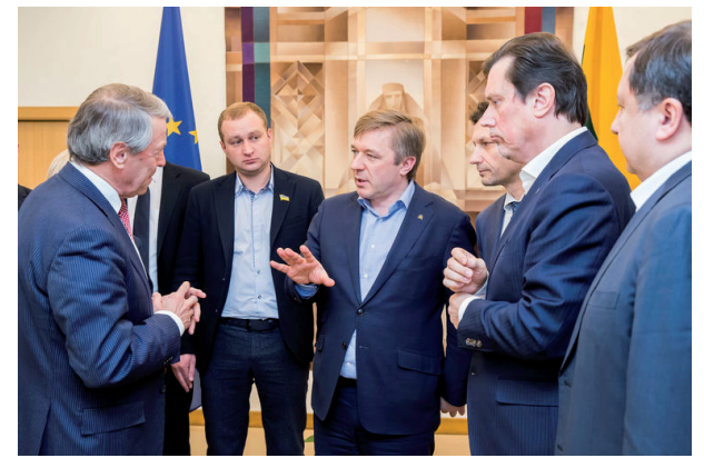
Meeting between members of the Seimas Committee on Culture and a delegation of members of the Verkhovna Rada of Ukraine. 27 March 2018