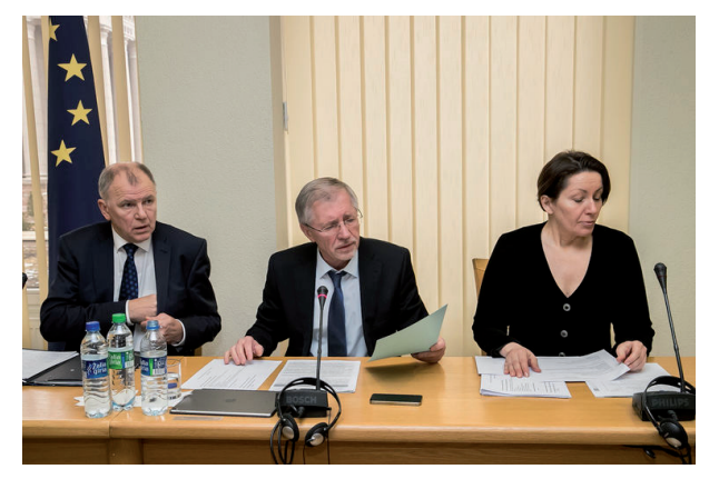
European Commissioner Vytenis Povilas Andriukaitis introduced the European Commission analysis of economic challenges for Lithuania in 2018. 23 March 2018