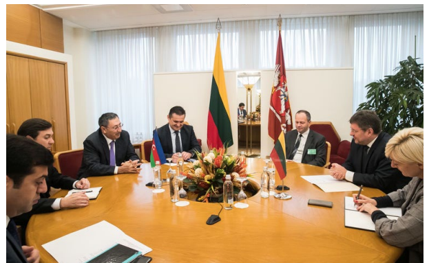
Meeting between members of the Seimas Group for Inter-Parliamentary Relations with the Republic of Azerbaijan and Khalaf Khalafov, Deputy Minister of Foreign Affairs of the Republic of Azerbaijan. 7 September 2018