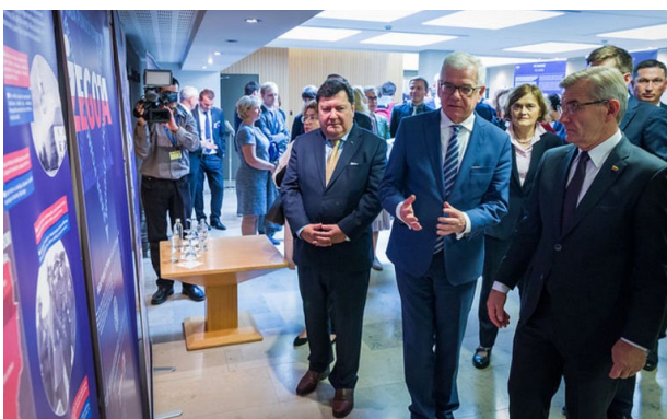
The Seimas hosted the exhibition Żegota. Council to Aid Jews . The exhibition was opened by Viktoras Pranciškis, Speaker of the Seimas, and Jacek Czaputowicz, Minister of Foreign Affairs of the Republic of Poland. 13 September 2018