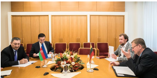
Juožas Bernatoniš, Chair of the Committee on Foreign Affairs, met with Khalaf Khalafov, Deputy Minister of Foreign Affairs of the Republic of Azerbaijan. 6 September 2018