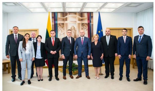
Meeting between the Committee on National Security and Defence and the delegation of the Committee for Defence, Public Order and National Security of the Chamber of Deputies of the Parliament of Romania. 17 September 2018