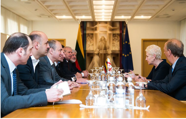
Meeting between Irena Degutienė, Deputy Speaker of the Seimas, and the delegation of members of the Parliament of Georgia. 18 September 2018