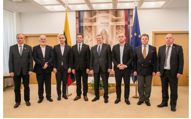
Meeting between members of the Committee on Foreign Affairs of the Seimas and the delegation of members of the Parliament of Georgia. 19 September 2018