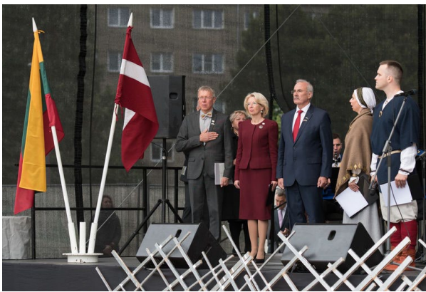
The delegation of members of the Seimas Group for Inter-Parliamentary Relations with the Republic of Latvia joined the celebrations of the Day of Baltic Unity in Jelgava. 24 September 2018