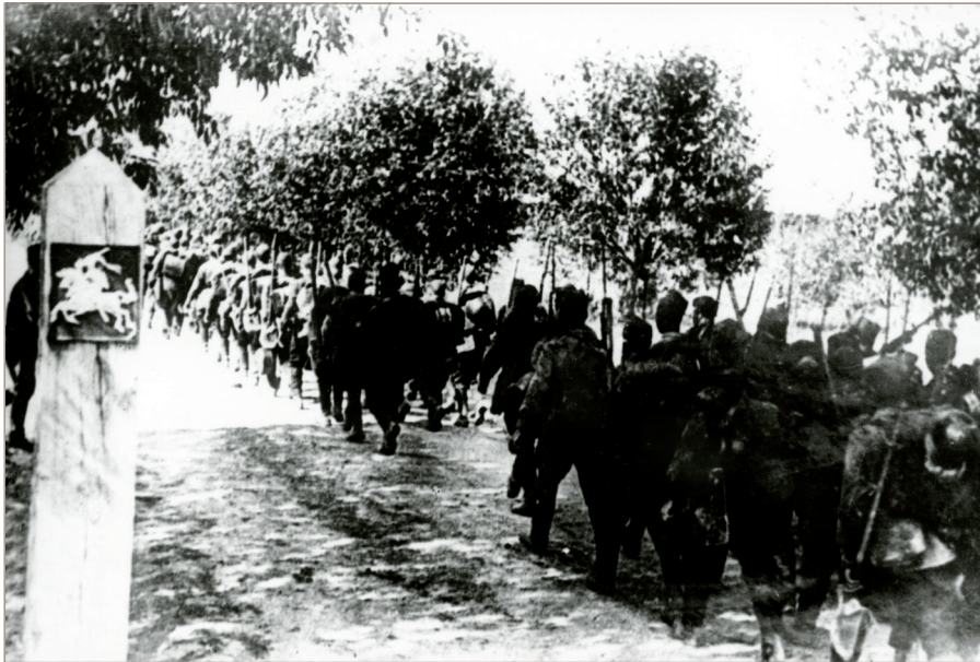
Red Army troops crossing Lithuania-USSR border. 15 June 1940

Treaty on Mutual Assistance, was required to form a new government that would be acceptable to Moscow and to allow free entrance of an unlimited contingent of Red Army troops into the Lithuanian territory. With this ultimatum, the USSR grossly violated all peace and non-aggression treaties that had been signed with Lithuania by then. Molotov insisted that the Lithuanian government replied to the ultimatum by 10 a.m. (9 a.m. local time) the next day. Molotov stated to the Lithuanian diplomats, "Whatever your answer, the troops will enter Lithuania tomorrow anyway."