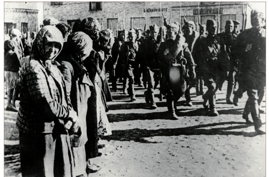
Red Army units marching in the town of Eišiškės on 15 June 1940