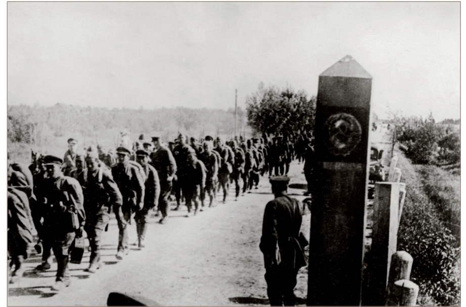
Red Army troops crossing Lithuania-USSR border. 15 June 1940

course of the occupation of the Baltic States, the Soviet army lost 58 troops (15 of them committed suicides, 15 – drowned and 28 – died) while 158 injured troops completed the invasion.