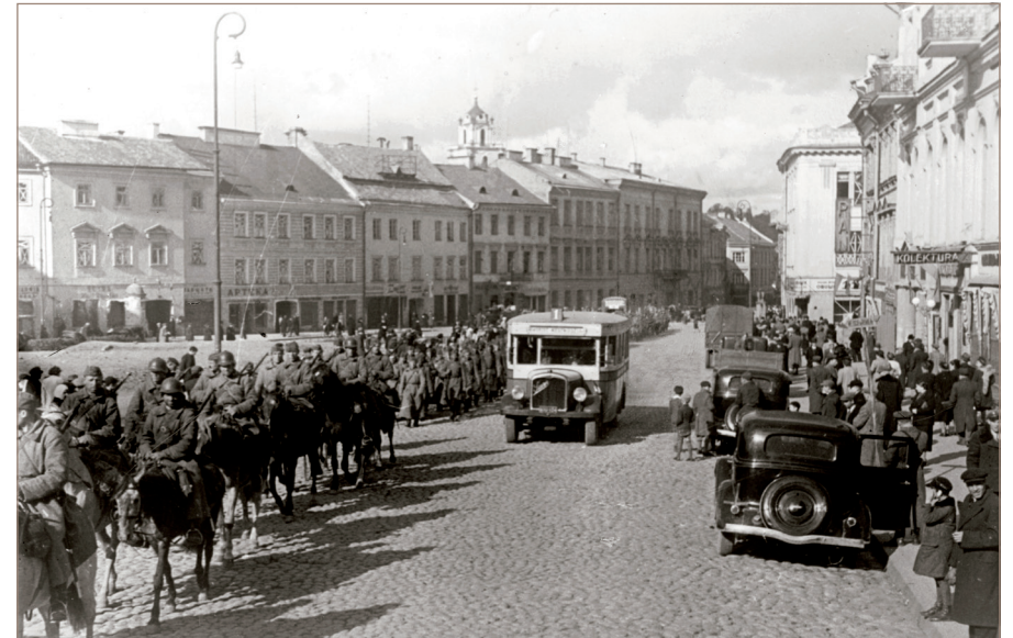
A column of Red Army troops in Vilnius. September 1939

Lithuania. On 27 September 1939, Stalin had a meeting with Ribbentrop in Moscow and said that Estonia would "temporarily" continue with the existing governing