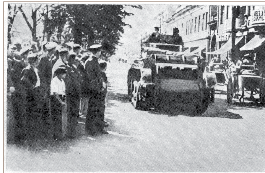
The invading army enters Kaunas on 15 June 1940

The experience of the Baltic States in 1940 serves as a good lesson. Taking it into account, Russia's actions in Ukraine in 2014 prove to be a serious and dangerous violation of international law. By annexing Crimea and building up its army by the Ukrainian borders, Russia has not only done harm to Ukraine but has also damaged the system of international agreements. The European Parliament has noted that "Russia's assertion of the right to use all means to protect Russian minorities in third countries [...] is not supported by international law and contravenes fundamental principles of international conduct in the 21st century, while also threatening to undermine the post-war European order." According to Jeffrey D. Sachs, Professor of Economics at Columbia University, if Russia fails to change the course of its policy, we may well have to face global consequences, and international relations will become more tense and full of nationalism. A mistake on any side may lead to a tragic war. If we take a look at the events of the last century leading up to the beginning of World War I, we will always be able to find evidence proving that the only way to ensure security in the world is international law, which is supported by the United Nations and respected by all countries.