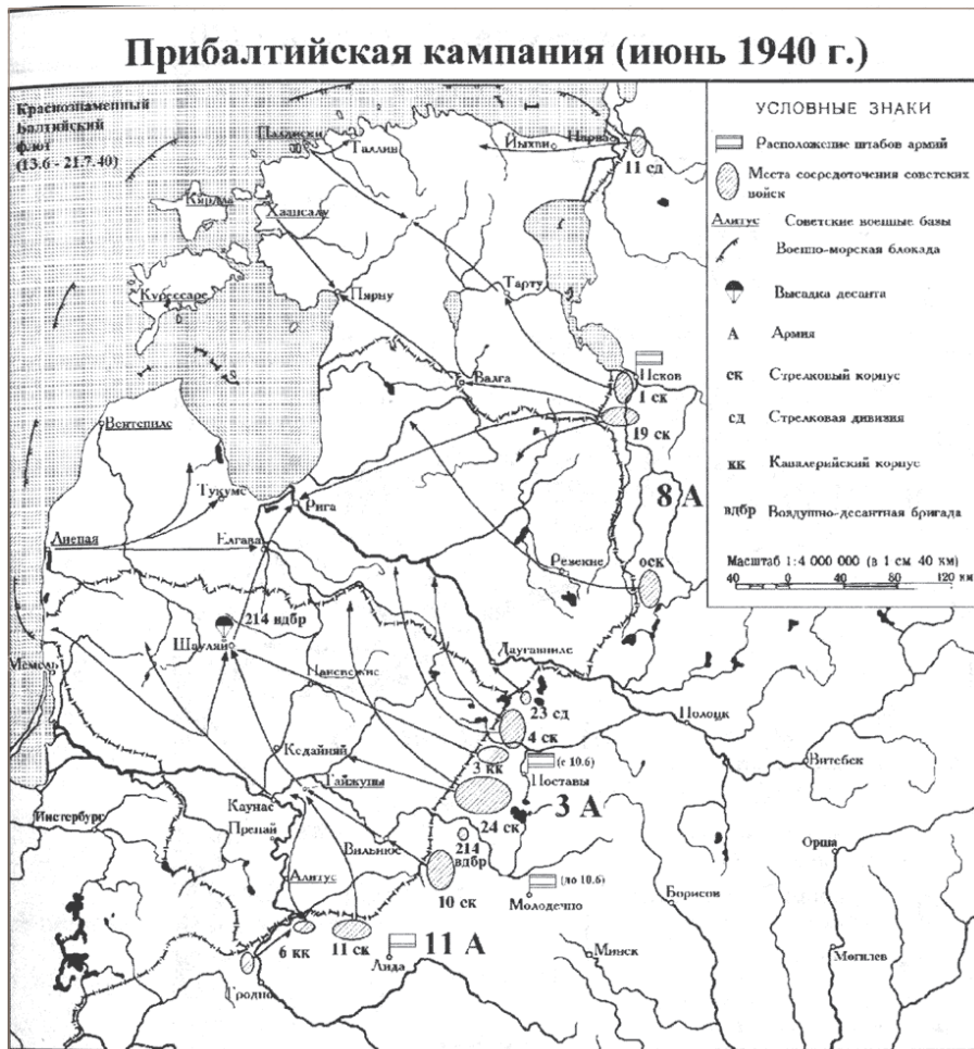
The plan of the occupation

of major military action. Notably, the decision concerning this was made on the eve of the ultimatum issued to Lithuania. The Lithuanian troops, drawn away from the Lithuanian state border, were stationed in military garrisons in the central areas of the country. Meanwhile, the Red Army radio stations were waiting for the signal to begin the operation. On 13 June, seven paratroopers appeared near Gaidžiūnai, tasked to make preparations for accommodating a larger airborne force. However, Lithuania was occupied without any battle. This happened owing to the troops mobilised at the borders of the country and the massive political, military, and diplomatic pressures.