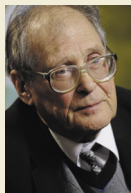
Sergei Kovalev.